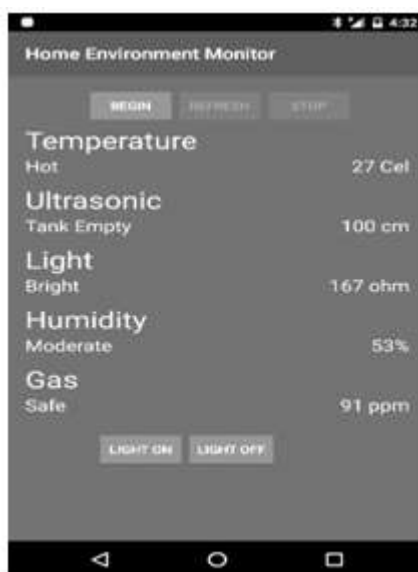
Figure 4 Client Side Android Application

The Android mobile application provides a simple user interface to display the home conditions of the user at his fingertips. It also shows comments as text and the actual sensor values. The user receives push notifications in case of emergency situations such as gas leak and alerts the user when customized requirements are met such as water tank being full and refrigerator being left open. The Application also provides the option to control the home lighting by switching on and off the lights of the home from the mobile application. A screenshot of the mobile application can be seen in the following figure.